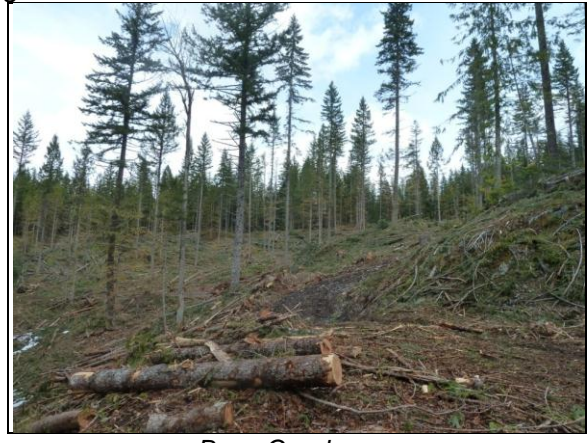
Brew Creek area

Several small reforestation projects were completed in 2011 totaling 4.8 hectares. The silviculture account stands at $72,906 (Dec 31, 2011). The funds are held in a Richply account to cover reforestation obligations.