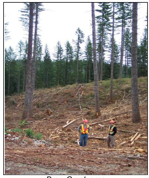
Brew Creek area